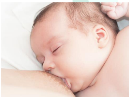
Baby with top lip in neutral position

To understand the validity of the theory that upper lip restriction causes feeding issues we need to look at how the baby attaches to the breast. Older breastfeeding literature talked about both the upper and lower lips flanging during breastfeeding to form 'fish lips'. The idea that 'fish lips' are a good sign still litters the internet and popular literature on breastfeeding. However, ideas about the role of the upper lip have changed. In actual fact only the lower lip should flange.