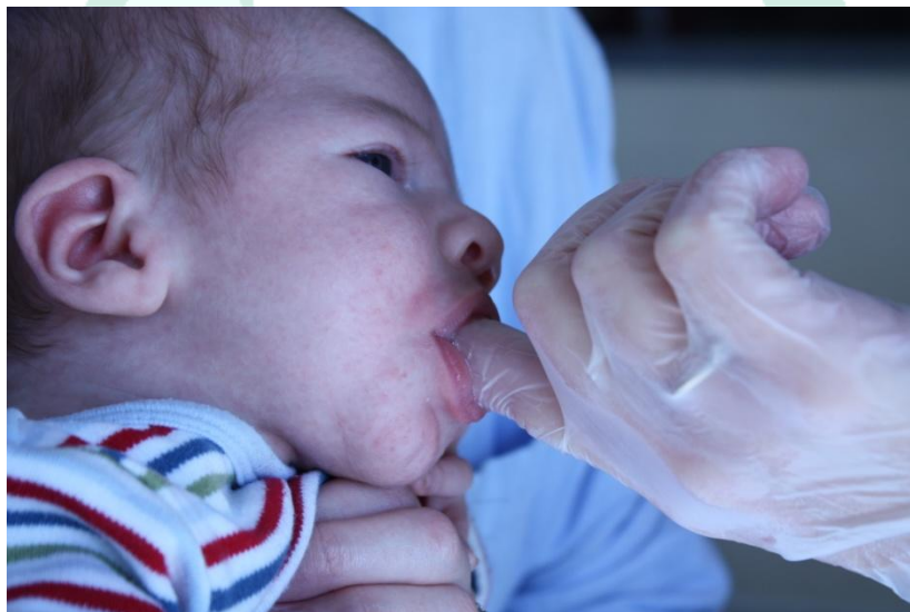
Assessment of suck, part of the assessment for tongue-tie

There is a useful video clip and information on tongue-tie assessment here http://www.tongue-tie.org.uk/tongue-tie-information.html