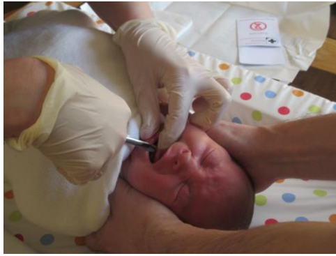
Division with scissors