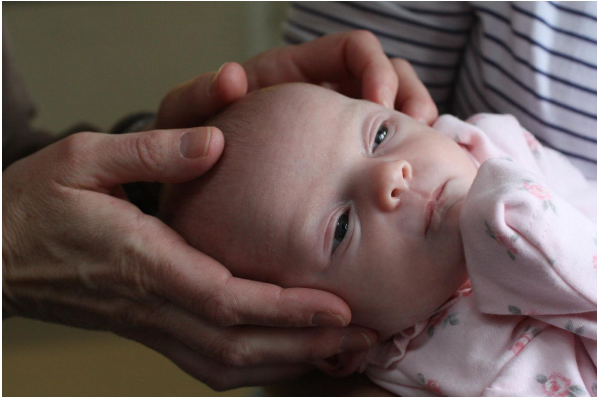
A baby having cranial osteopathy