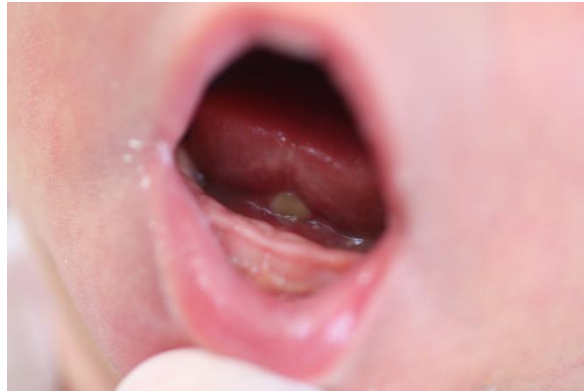
Normal healing 5 days after division